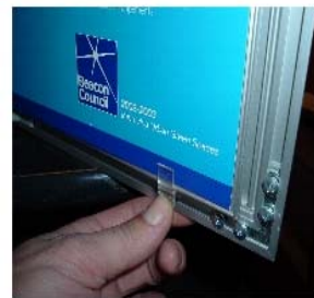
Simple Poster clip method